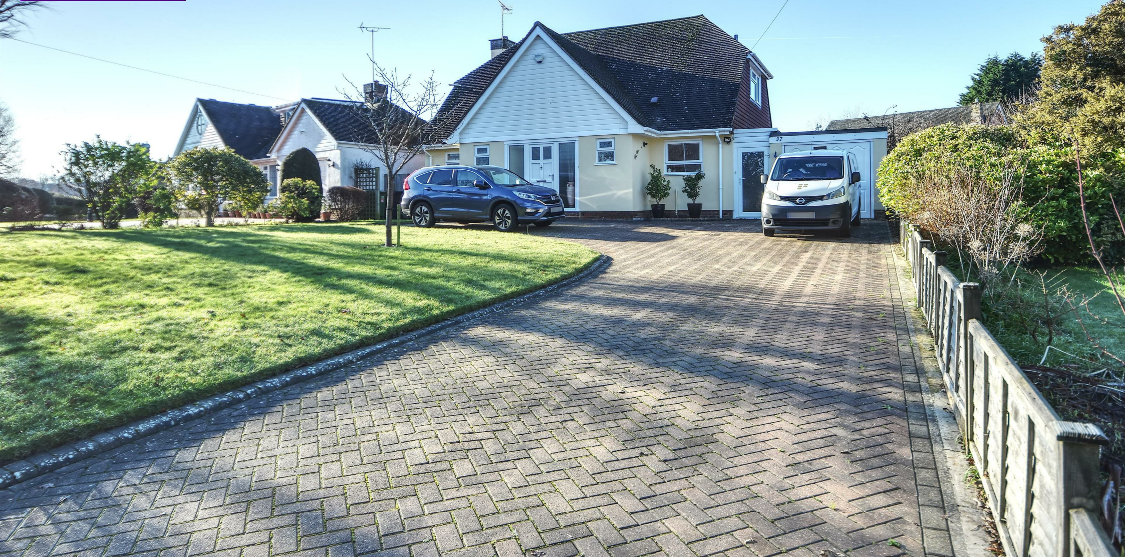
37 Collington Lane East, Bexhill on Sea, East Sussex TN39 3RQ £700,000